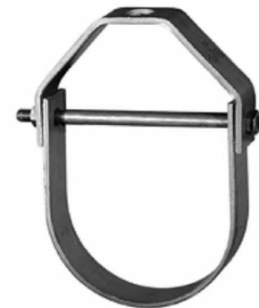
STANDARD ADJUSTABLE CLEVIS HANGER